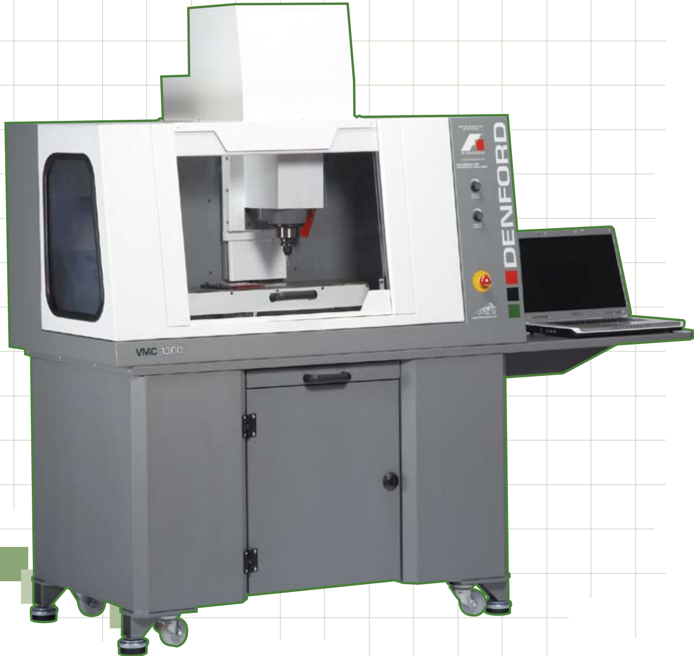
Shown with optional universal bench and optional computer support extension. (PC not included)