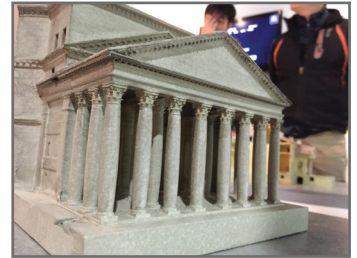
Transference polishes, paints or electroplates models to create the necessary look and feel, like the weathered feel for this model.

Since incorporating 3D printing into its design process, Transference has increased productivity. It has also participated in many local and overseas architectural model design competitions, gaining the reputation as a leader in Taiwan’s architectural modeling industry. “The Fortus 3D Production System has expanded our possibilities and fostered creativity in our team. We believe that 3D printing will radically change this industry in Taiwan, and I’m glad that we have made the decision early,” concluded Li.