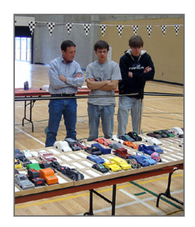
Derby racecar designs displayed.