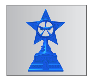
CAD rendering of the first place trophy that was printed with a Dimension 3D Printer.

Stratasys | www.stratasys.com | info@stratasys.com