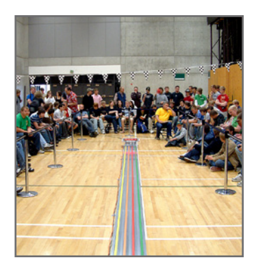
Students gather for the big race.

Oh, and the prizes? They are trophies printed using the Dimension 3D Printer. "The 3D Design Derby allows high school students from around the state to engage with UVU in learning and applying engineering, design, 3D modeling and prototyping skills in a fun and competitive setting," says Manning. "The interaction among students and the confidence they gain in their skills help promote engineering as an exciting and viable degree option for these kids. And frankly, none of that would be possible without the cars produced through the Dimension 3D Printer."